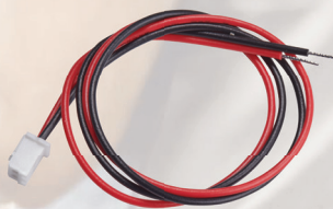
Plug-In DC Line Powered Cable Adapter Harness (Optional)

Ideally Designed For: Retrofit applications where power functionality ( battery or hard-wired ) offers installation and performance flexibility