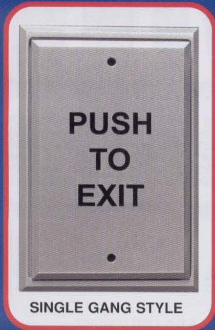
SINGLE GANG STYLE